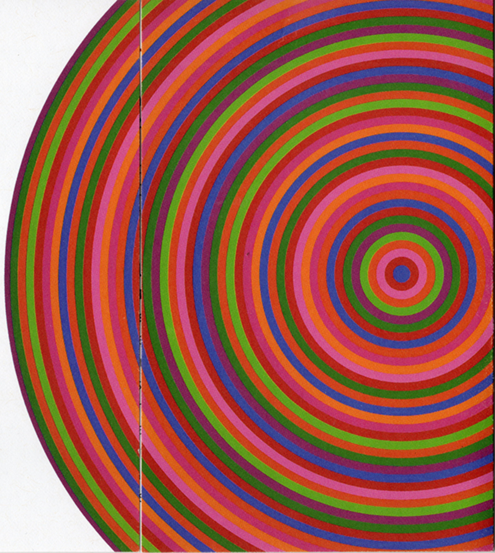
Image: Claude Tousignant, Chromatic Accelerator (detail), 1968, Acrylic on canvas 243.84 cm (diam.). On loan from the artist, Montreal.

Co-produced by the Varley Art Gallery of Markham and the Musée national des beaux-arts du Québec